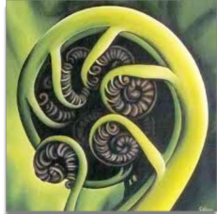
Little by little, the fern unfurls the parts she once hid from the world (author unknown)

Over the year , students discover their birthright gifts, explore their spiritual journey, read books and articles, view life-changing documentaries, engage monthly in a variety of soul-forming activities, develop a spiritual community with a small group of co-learners and holy listeners, and experience teaching and formational activities built around time-tested concepts. A blend of intellect and experience, individual and community, social justice and contemplation, the program is deeply centered on Christ and rooted in the Gospel. The robust curriculum helps students become more open, receptive and responsive to God's transforming grace.