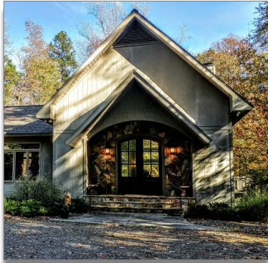
View the Farm and spacious retreat house at www.TheLydiaGroup.com .